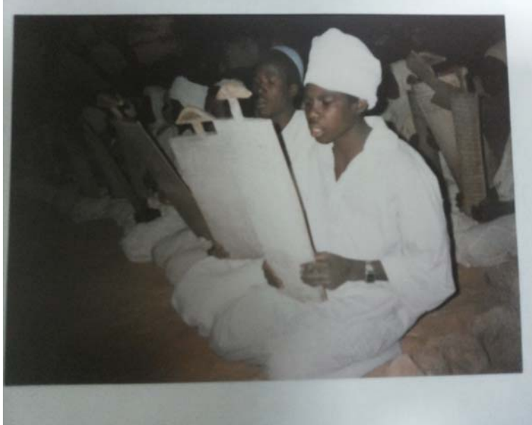
Figure 5: students reciting Quran in the Khalwa of Turba in Dar Zaghawa