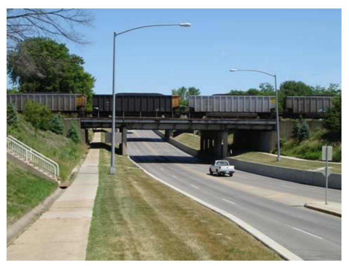
Annex VI: Sight Distance at an Undercrossing on a Sag Vertical Curve