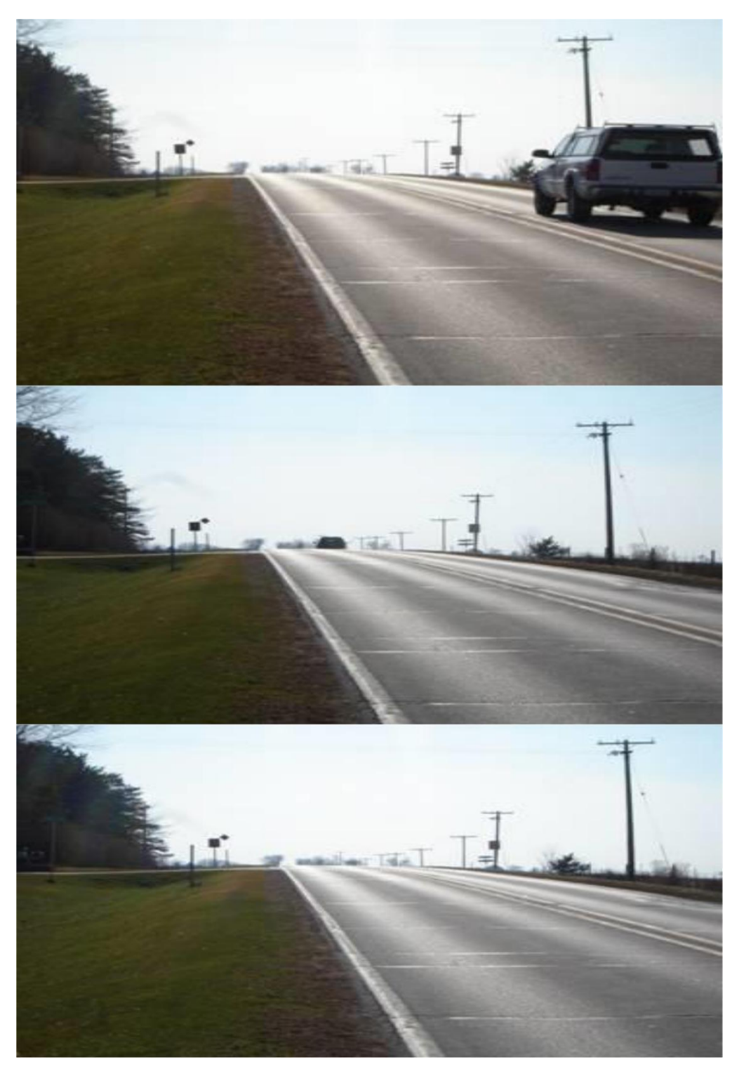
Annex IV: Vertical Stopping Sight Distance at a Crest Vertical Curve