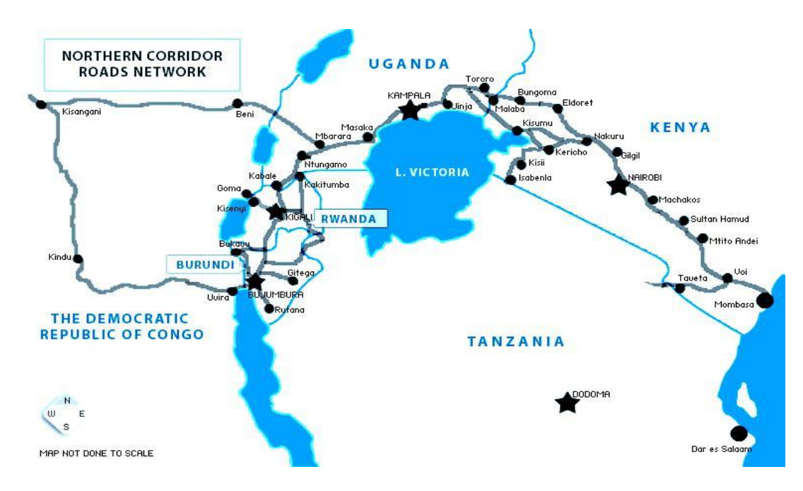
Figure 1: Study Location and Area